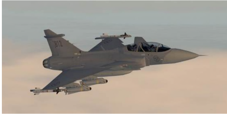
JAS-39A/B/D Callsign: Gripen