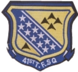
41 st Tactical Fighter Group